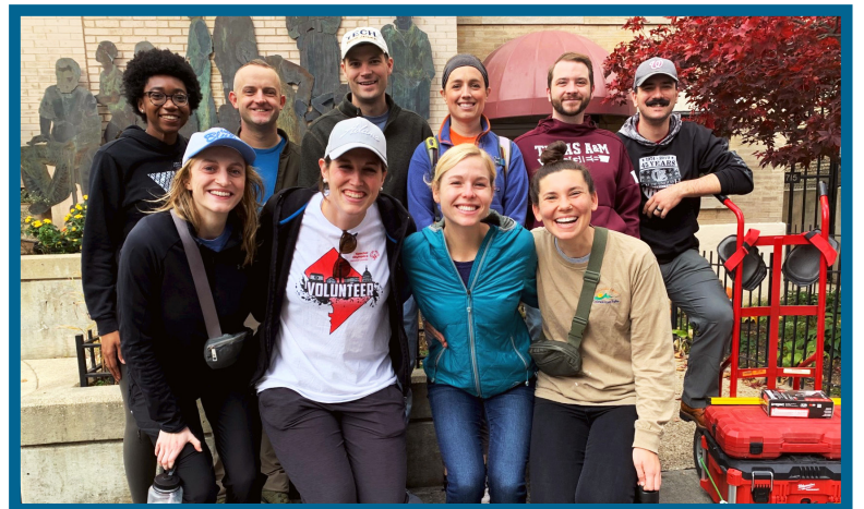
Volunteers from Grace Capital City, after helping with maintenance work at Kairos House.