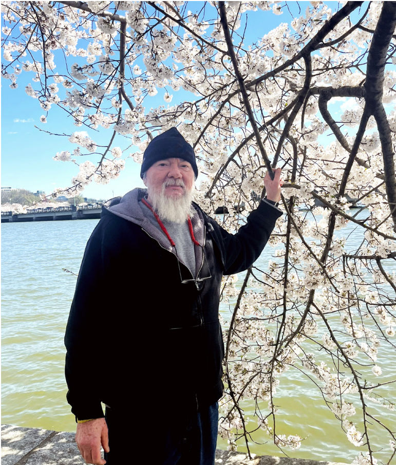
Patients and staff members enjoying the cherry blossoms.

“I’ve been in DC for 24 years and I’ve never been to the cherry blossoms.”