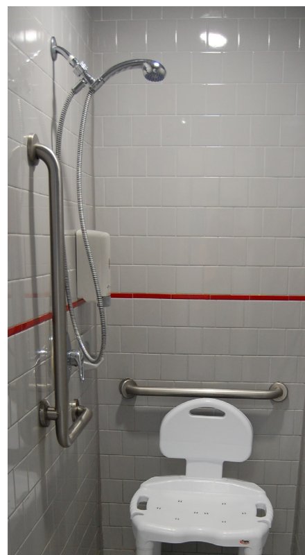
Current shower stall on Christ House's respite floor

With generous support from the CDC Foundation in partnership with the National Institute for Medical Respite Care, Christ House has begun planning for renovations to make our showers ADA compliant. Changes will include the removal of the step to enter the shower and the addition of a handrail in the shower, as well as the addition of handrails throughout our respite floor hallway. We look forward to sharing additional updates regarding the progress of our building renovations and the beneficial impact this update will have in serving individuals in need of our life-giving services.